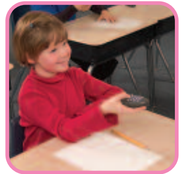
Students are excited and eager to respond interactively

InterWrite™ PRS is a powerful student response system that combines interaction and assessment to enhance classroom productivity. No child is left behind when all students participate by answering questions with a simple click of a button. The newest addition to the InterWrite™ PRS family, InterWrite™ PRS RF , gives teachers even more options to teach and assess their students. InterWrite™ PRS RF features a 2-line LCD display that allows students to see their answers and receive instant notification that they were successfully transmitted. The 16-character display is also ideal for self-paced exams, especially in high-stakes state testing, where students can easily scroll through a series of questions and answer at their own pace. With InterWrite™ PRS RF , students's responses can include positive and negative numbers, decimal points, fractions, multiple correct answers, answer series, and even short answers. Teachers now have a powerful tool to go beyond asking simple multiple choice and true/false questions. Whether InterWrite™ PRS is used to take attendance, give quizzes or tests, analyze student assessment data and reports, or just perform a quick lesson review - teachers can focus more time on teaching and less time on paperwork and grading.