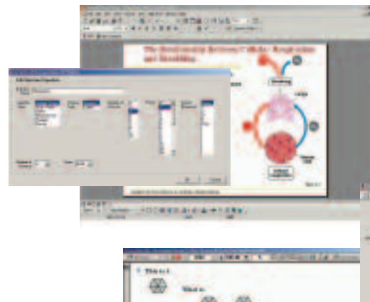
Change any PowerPoint® slide into a PRS question slide